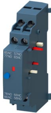
signaling switch for circuit breaker 3RV2 with screw terminal